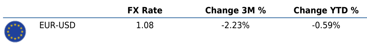
TABLE 1: USD-BASED AS OF March 31, 2024

EM | Emerging market currencies were generally weaker in Q1, as the MSCI EM Currency Index fell close to -1% in a turbulent month, with Mexican and Columbian peso as the rare outperformers against US dollar this quarter. In China, political tension with the US continued as US lawmakers made attempts to discourage investments into China, with further pressure from the Fed's higher for longer stance.