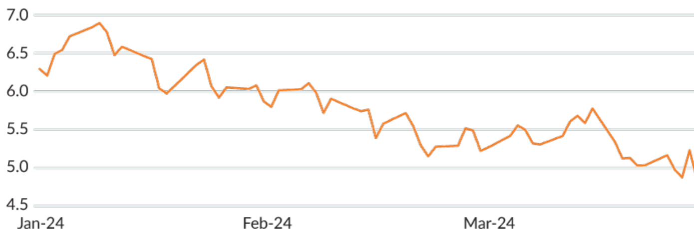
FIGURE 2: MCM'S GLOBAL VOLATILITY INDICATOR: JANUARY 2024 - March 31, 2024

Figure 2 shows a line chart of MCM's Global Volatility Indicator between January 2024 and March 31,