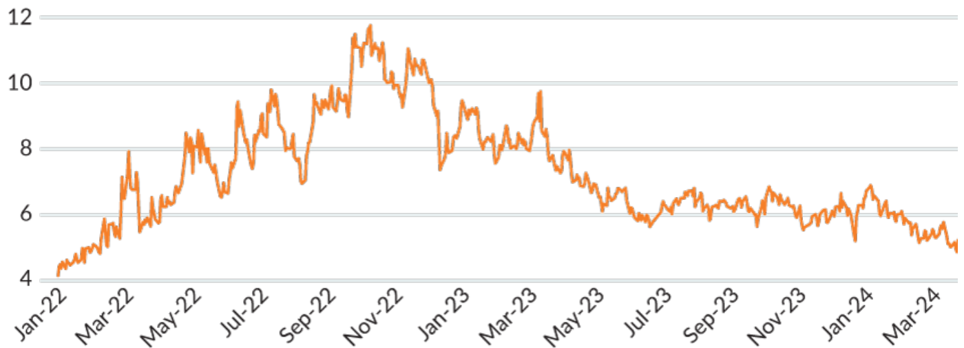
FIGURE 3: MCM'S GLOBAL VOLATILITY INDICATOR: JANUARY 2022 - March 31, 2024

Figure 3 shows a line chart of MCM's Global Volatility Indicator between January 1, 2022 and March 31, 2024. The GVI begins at 4.15 in January of 2022. It rises through 2022 and reaches a high on October 13, 2022 (11.75). The GVI then falls and reaches 4.64 on March 28, 2024.